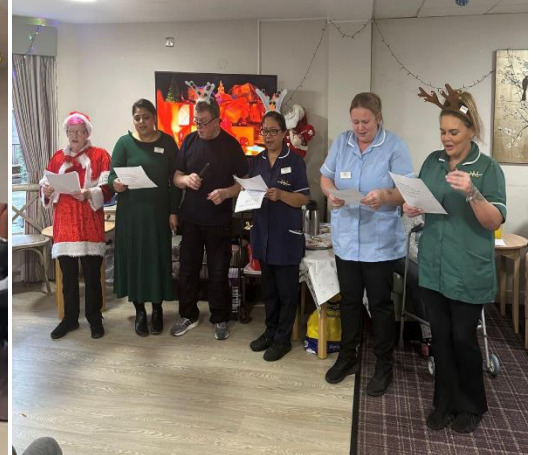
Our residents enjoying 'Puss in Boots' Pantomime and our very own Newbury Manor Nativity! As well as Christmas Carols and enjoying delicious food!